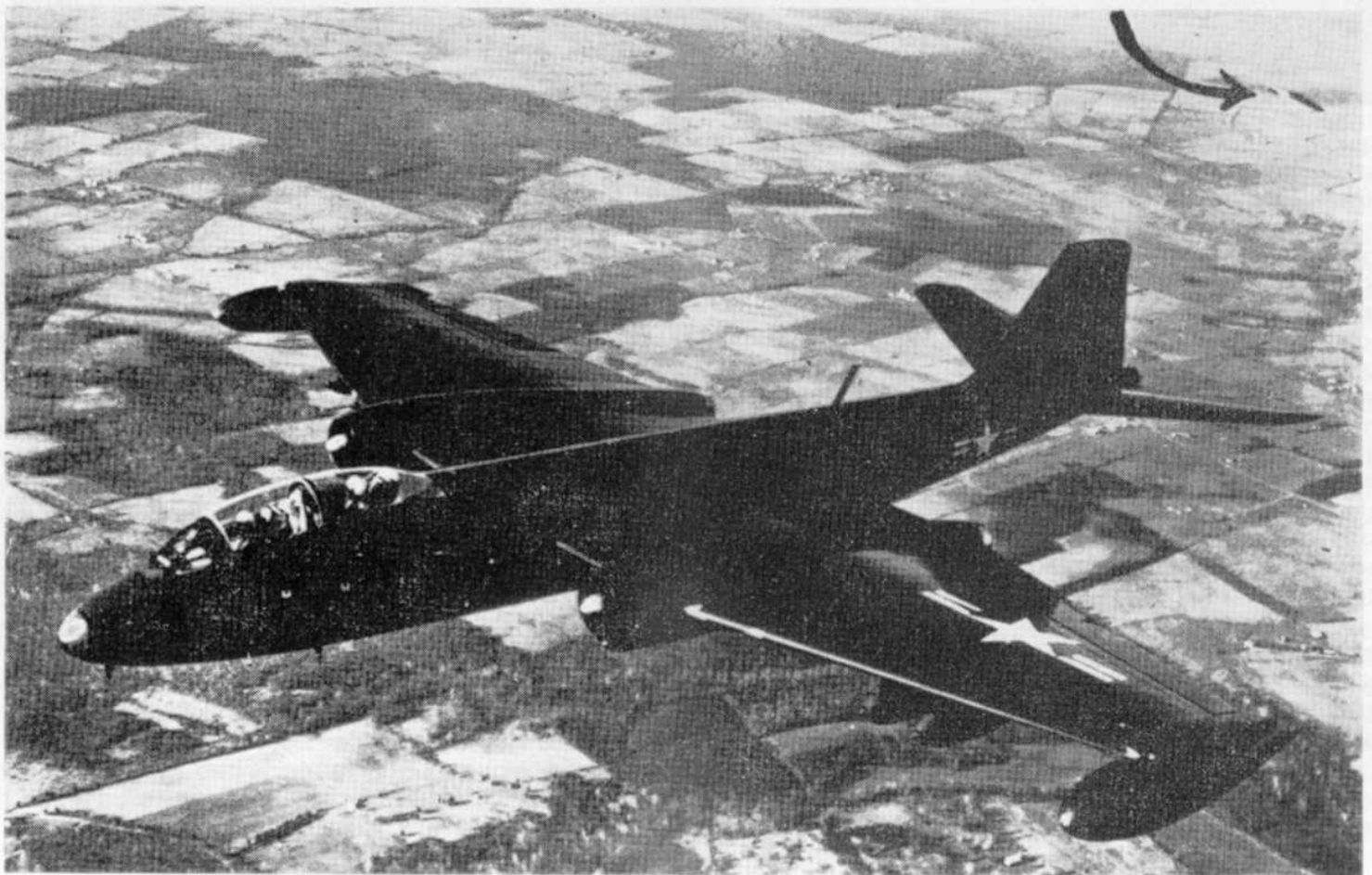
Print made from the original negative — not "retouched". This was photo 9 in the NICAP set

by the NICAP Subcommittee of New York. Another picture in the series (prepared by NICAP and not by the Martin Company) showed an enlargement of the